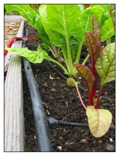
Figure 8. Drip irrigation system, Merritt College Urban Garden, Oakland, Calif.

Substantial amounts of potable water in cities are lost to evaporation and runoff due to a lack of water management. Implementing sustainable water practices in cities promotes reduced dependence of municipal water supply and infrastructure. More specifically, the methods of water retention and harvesting effectively decrease reliance on public water systems by