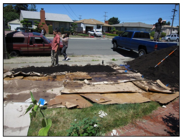
Figure 6. Sheet mulching for garden transformation by Planting Justice

In addition, sheet mulching decreases water evaporation. The "lasagna" forms a protective layer between the soil and the sun reducing evaporation, and further water runoff is slowed. This results in greater ability of the soil to retain available moisture and diminishes the need to provide excess irrigation water (Elevitch & Wilkinson 1998). Planting Justice incorporates this technique on all of their garden projects because of its essential benefits for plants and water collection.