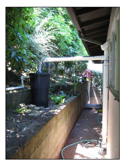
Figure 1. Rainwater catchment system installed by Planting Justice in Oakland, Calif.

There are four main components to rooftop rainwater harvesting systems: 1) a rooftop – the catchment area; 2) a gutter downspout – to divert the water to storage (Figure 1); 3) rain barrels or cisterns – to store the water (Figure 2); 4) a distribution method – to redirect water from storage to the landscape. When it rains, the water that would otherwise run off into storm sewers is diverted into a cistern (Figure 1). A metal mesh is used to strain any debris that may get into the tanks. The clean rainwater can then be distributed by various mechanisms into the landscape via a simple hose, a drip irrigation system, channels, pumps, etc. (Waterfall p. 9).