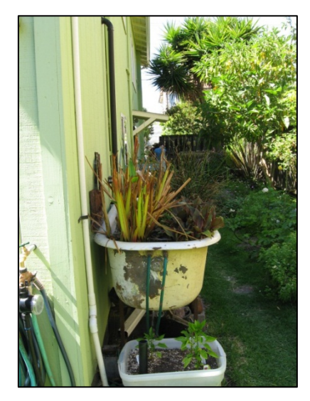
Figure 5. Recycled bathtub bio-filter for greywater system connected to drip, Beegrrl Gardens, Oakland, Calif.

A greywater system captures water that has been lightly used, but has not come into contact with high levels of contamination, e.g., sewage or food waste. Water that has been used once in a shower, clothes washing machine, or bathroom sink can be diverted for outdoor irrigation through relatively simple tweaks in basic plumbing. The demand of potable water for irrigation and the streams of wastewater produced by the shower, washing machine, and sink are reduced. Possible public health concerns can be mitigated when greywater systems are designed and implemented properly. For example, some greywater-to-landscape systems utilize bio-filters or contained areas with water-loving plants to filter water before it enters an irrigation system (Figure 5).