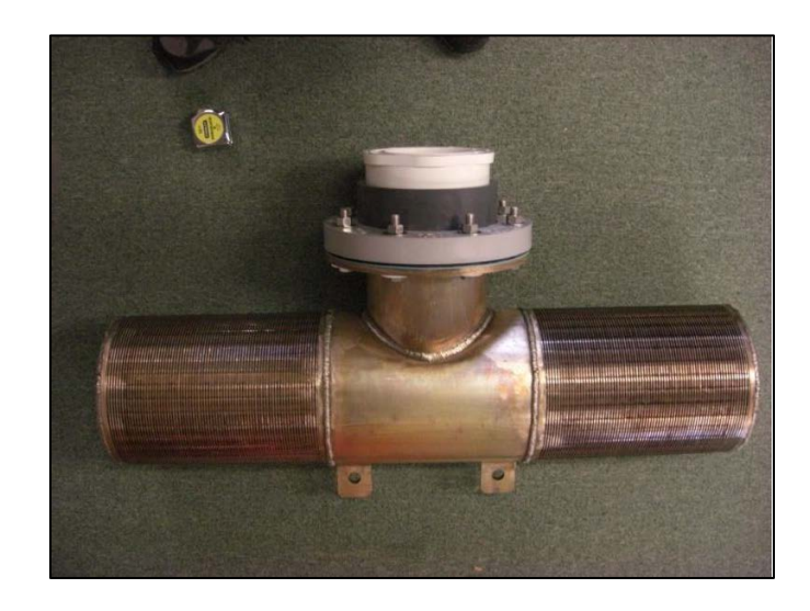
Figure 3. Wedgewire Screen Module Used in Testing During Studies for Santa Cruz and Soquel Creek Water Districts in 2009 and 2010

Air bubble curtains are created by pumping air through a diffuser to create a continuous curtain of bubbles. Most studies have found that air bubble curtains are not effective, although a