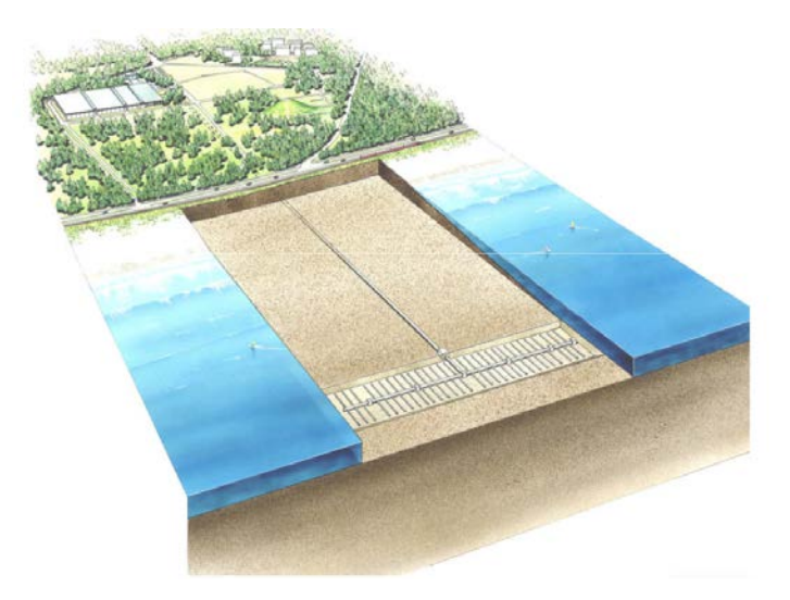
Figure 5. Infiltration Gallery Design at the Fukuoka District Waterworks, Japan.

vertical flow, resulting in a greater yield per well (Missimer et al. 2013). Indeed, each horizontal collector well is typically designed to withdraw from 0.5 MGD to 5 MGD of source water (Mackey et al. 2011).