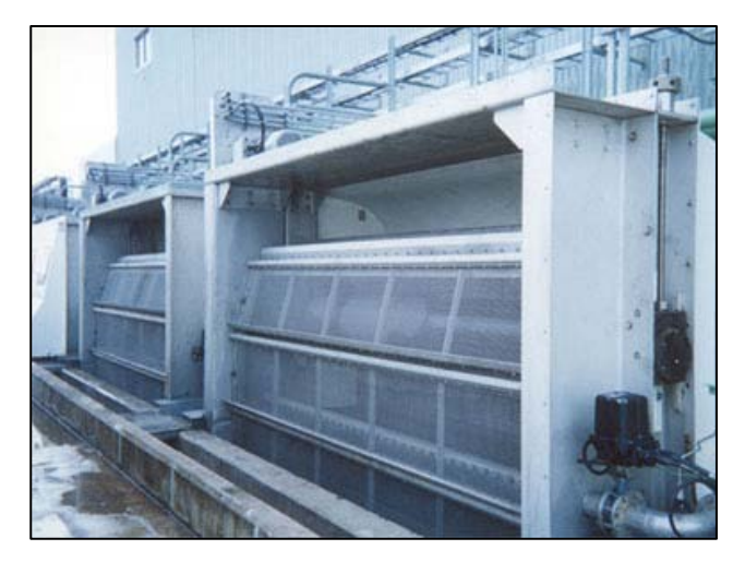
Figure 2. Example of a Travelling Screen Over an Intake

Travelling screens are mesh screens that are in continuous movement. The screens are equipped with mesh panels, and as the panels move out of the flow of water into the desalination plant, a high-pressure spray dislodges the accumulated debris and washes it into a trench for disposal in